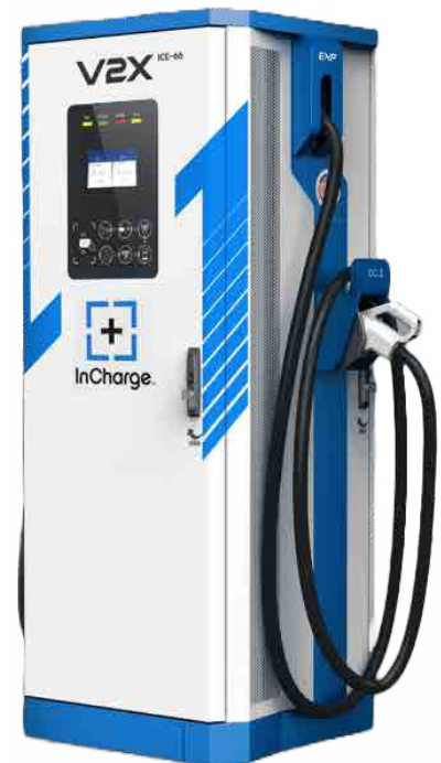
ICE-66 V2X DC Fast charger