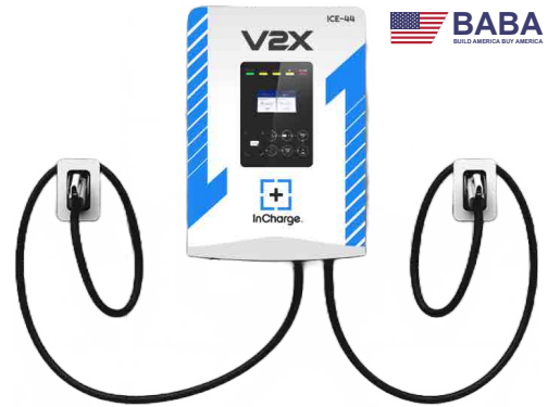
ICE-44 V2X DC Fast charger