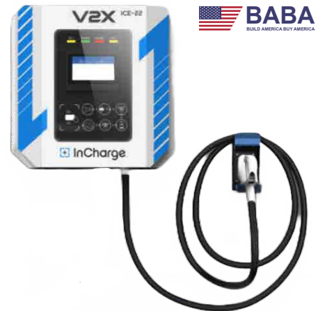
ICE-22 V2X DC Fast charger